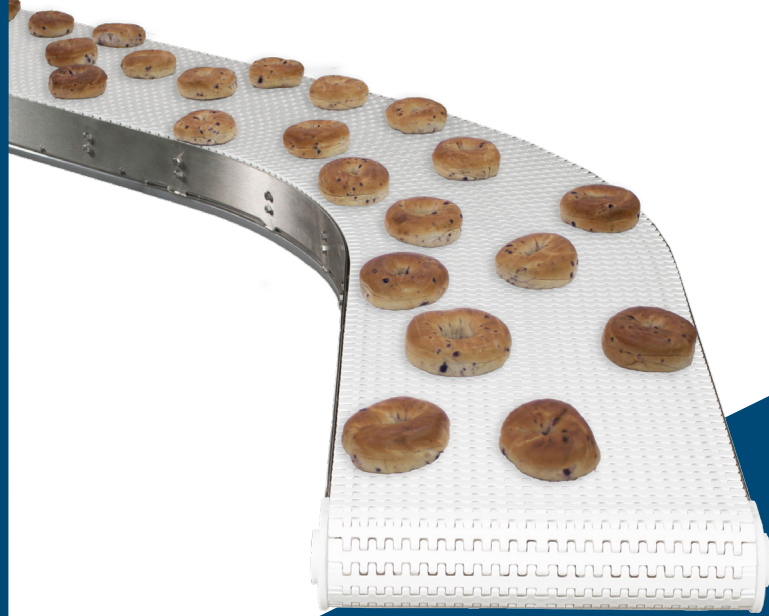
Table top chain

Fully adjustable incline & decline modules