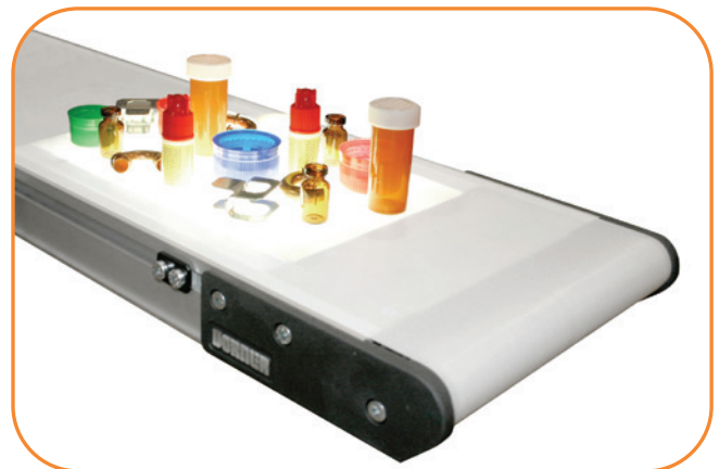
Ideal for a variety of products