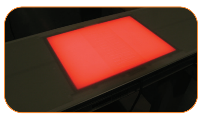
Variety of Light Colors Available