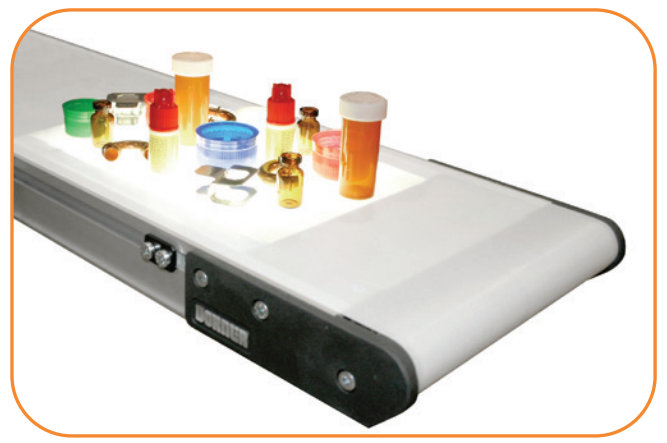
Ideal for a variety of products