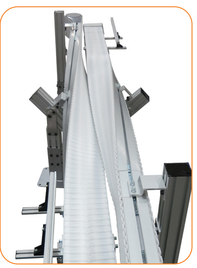
Helical Twist up to 90 Degrees