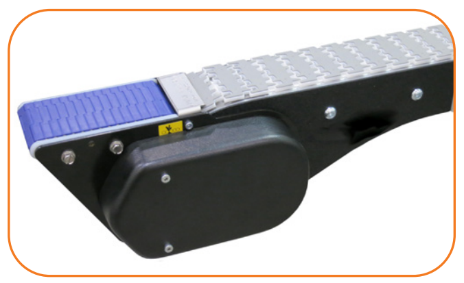
Optional Powered Transfer