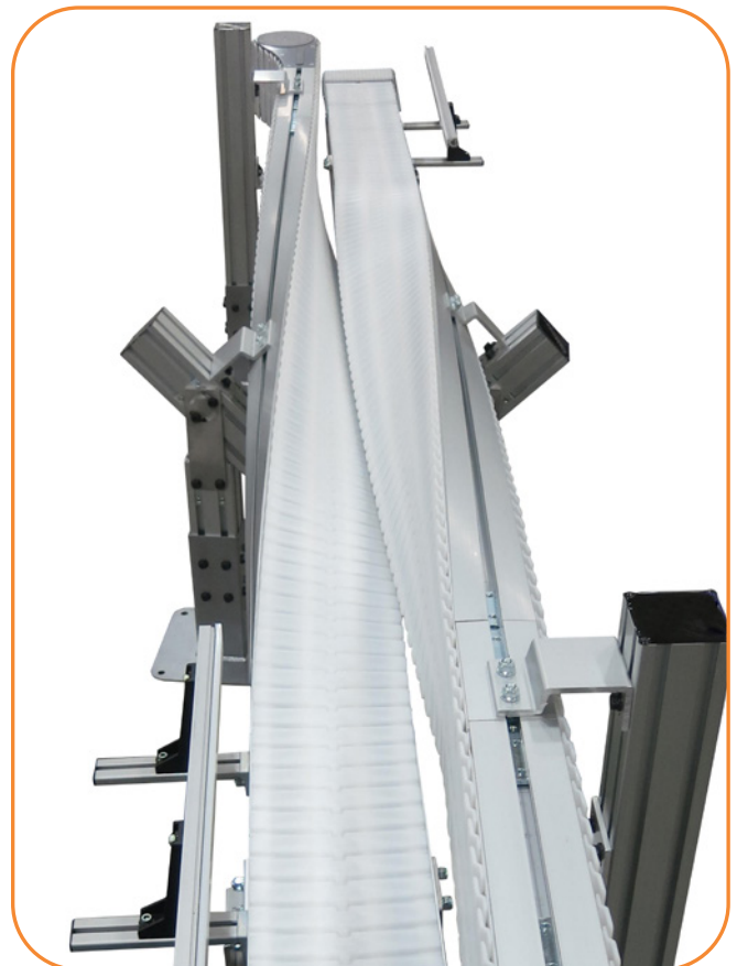
Helical Twist up to 90 Degrees