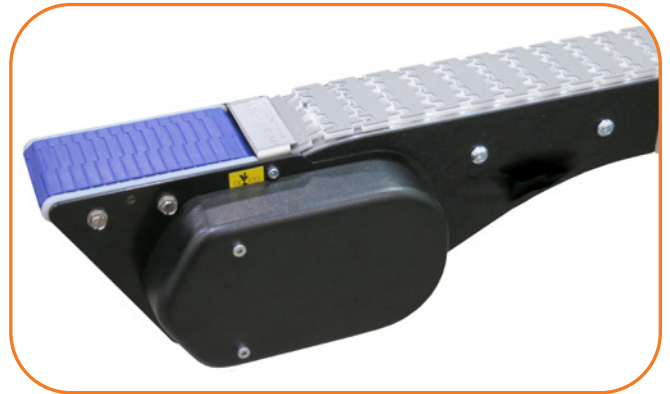
Optional Powered Transfer