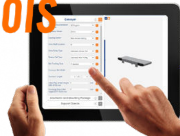
CAD Configurator Tool

Industry leading tool! Configure your own custom conveyor in minutes.