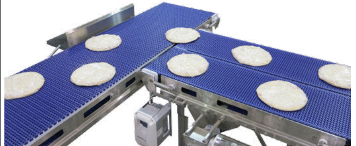
Sanitary Stainless Steel