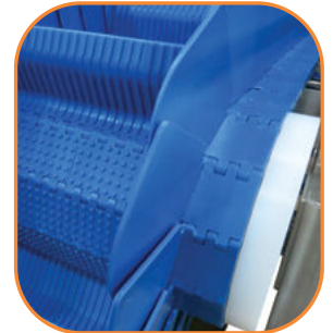
Modular Belt version also available.