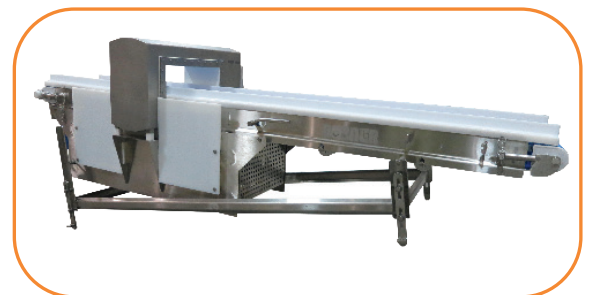
Also available on Dorner 3200 Series, AquaGuard, and AquaPruf Conveyors

DORNER MFG. CORP. PO Box 20 • 975 Cottonwood Ave. Hartland, WI 53029 USA